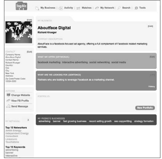
Figure 19-2: Create your own virtual business card with Tag Biz Pro.

Anyone who is interested in doing business on Facebook should use Tag Biz Pro. The Tag Biz Pro automates the relationship networking and referral process by creating a tag cloud, or cluster of words describing your business. Pick your keywords, invite your friends, and build your own business network with this professional networking app. (See Figure 19-2.)