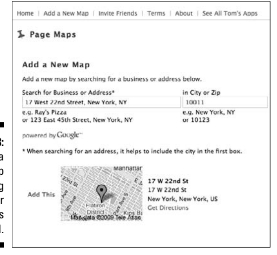
Figure 19-8: Create a map pinpointing where your business is located.

Ideal for companies with a physical presence, Page Maps allows you to add a custom map to your Page or personal profile. You can show your business locations or favorite spots around town. It displays a mini map requiring no additional clicks to see, and links to a larger map or directions. (See Figure 19-8.)