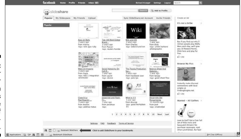
Figure 19-4: Post your own or choose from SlideShare's extensive library of presentations.

The Web's largest community for sharing presentations makes it easy to post your presentations to your Facebook Page. With SlideShare, you can upload your PowerPoint, PDF, Word, and Keynote presentations so that others in your network can view them. You can even embed YouTube videos in your presentations and add audio to make professional looking Webinars. (See Figure 19-4.)