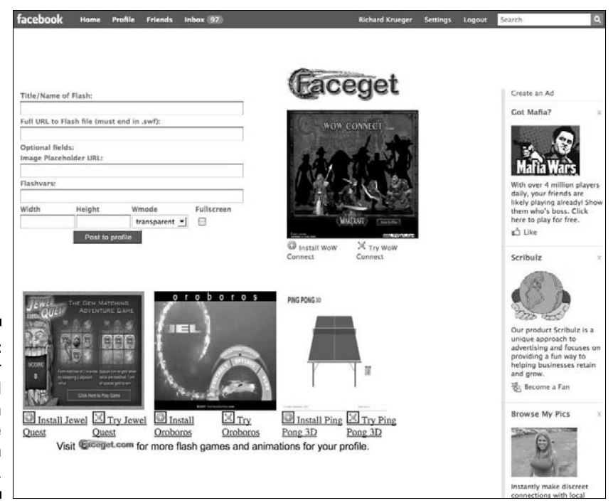
Figure 19-6: Let your Page stand out with a little Flash from FlashPlay.