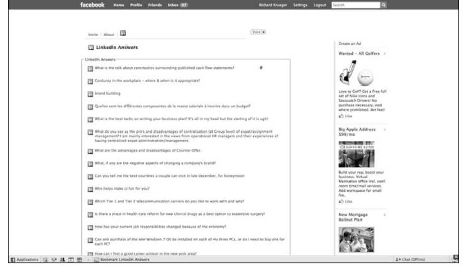
Figure 19-3: Tap into the wisdom of the crowd with Linkedin Answers.