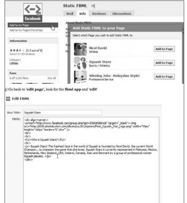
Figure 19-5: If you want to add some HTML to your Facebook Page, Static FBML is the app for you.

Although Facebook Pages are limited in terms of design customization, you can add the Static FBML app to any Page to integrate HTML directly on the Page. Developed internally by Facebook developers, this app lets you enter HTML or FBML (Facebook Markup Language) within a box for enhanced Page customization and added functionality. (See Figure 19-5.)