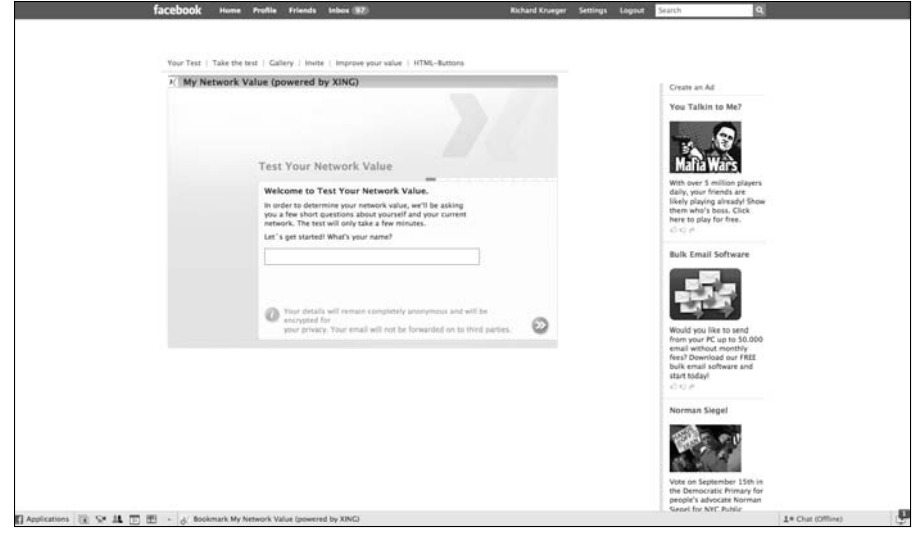
Figure 19-1: Find out your value within your network with Xing's My Network Value.